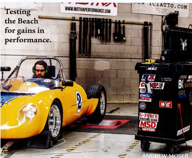
Testing the Beach for gains in performance.

We were able to show an increase in horsepower of more than 7% by simply changing the spark plugs to Pulstar. We can't wait to see how that translates on the track. You still can find an edge, even in a vintage race car, without major changes or expense. Q